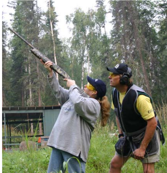
A Becoming an Outdoors-Woman participant receives individualized shotgunning instruction.